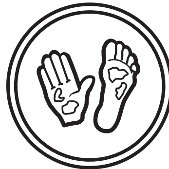
Cold or blotchy hands or feet