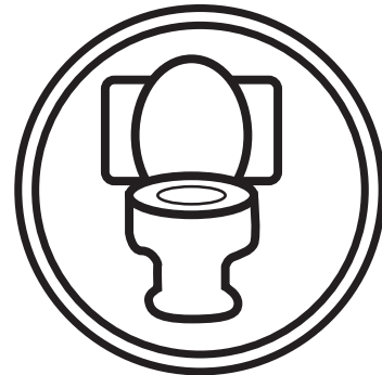
Not going to the toilet as much as normal